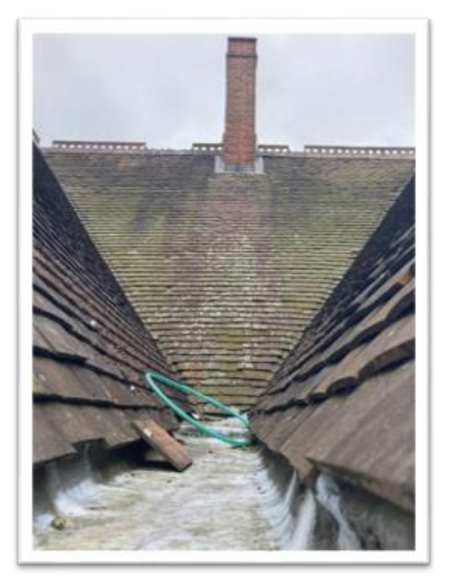
Photo 2: Typical lead gutter between roofs (Also show further tile & ridge damage)