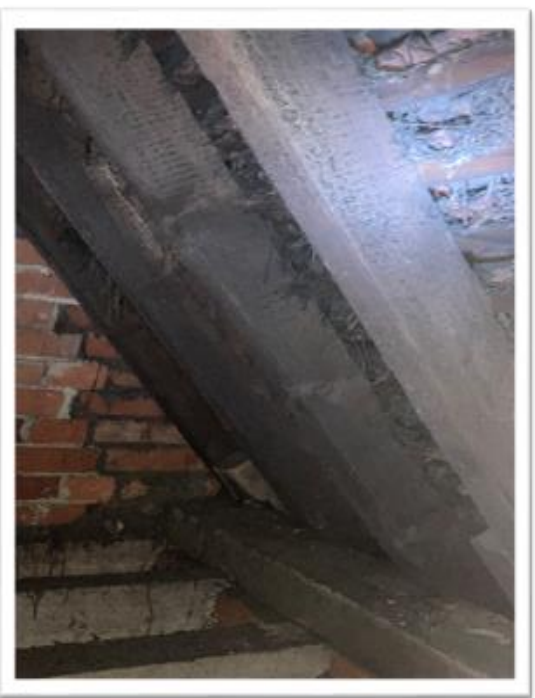
Photo 5 & 6: Remains of possible straw and plaster torching below tiles where roof voids accessible.