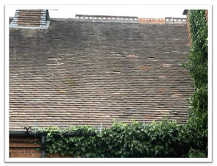
Photo 1: Ridges tiles are broken or have been replaced with a poor match. (Original ridge tiles centre)