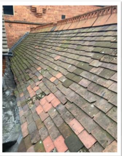
Photo 3 & 4: Existing roof section showing slipped/missing tiles & recent replacements